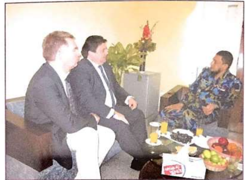
Exchanging views with UK Border Agency

Airport Armed Police envisions Hazrat Shahjalal International Airport as a world class airport as far as security and passengers' safety are concerned. Since taking up the responsibility of the overall security of the airport, AAP members put their sincerest efforts and maximum dedication to achieve its goal. On the passage of its two years journey, all the organizations working at the airport including Civil Aviation Authority Bangladesh (CAAB), Bangladesh Customs, Magistracy, Intelligence agencies like Special Branch, DGFI, NSI, the airline operators and other agencies extended their helping hands to AAP in securing its objectives. Airport Armed Police is indebted to all these agencies and expects future cooperation more explicitly.