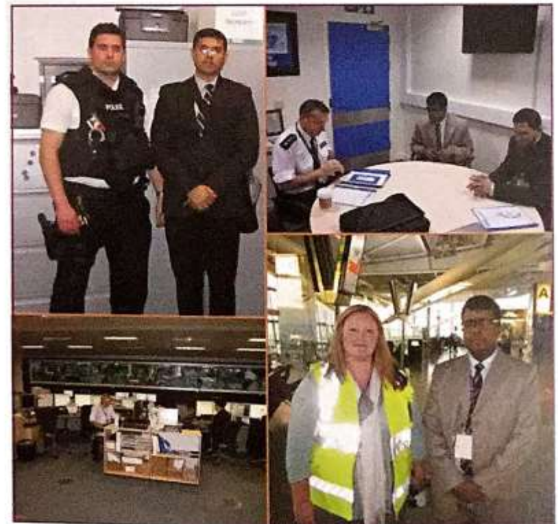
Heathrow Airport visit by AAP officials