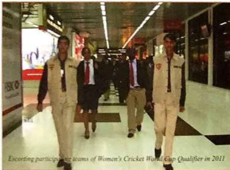
Escorting participating teams of Women's Cricket World Cup Qualifier in 2011

III. Searching and general checking at all the entries and inside the airport and examining travel documents, luggage or body of suspicious persons/passengers.