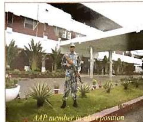
AAP member in guard position

Airport Armed Police (AAP) is empowered to ensure internal security, arrest armed terrorists, recover arms & explosives, and any other responsibility endowed upon by the Government as per Section 6 of the Armed Police Battalion Ordinance, 1979. As per the discussions at the