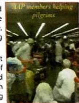
AAP members helping pilgrims

4.3 Crisis Response Team (CRT): Establishment of Crisis Response Team is another endeavor of AAP. Crisis Response Team has been raised and trained in the line of SWAT of DMP to deal with any emergency situation at airport including mass destruction, hostage crisis etc.