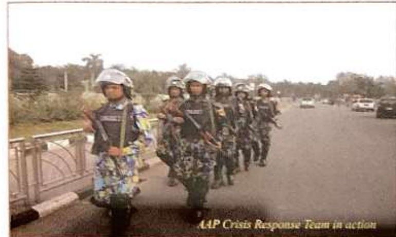
AAP Crisis Response Team in action

V. Coordination with other agencies working at the airport regarding any subversive activities, prevention of militancy or any other security related threats.